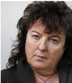
Carol Ann Duffy